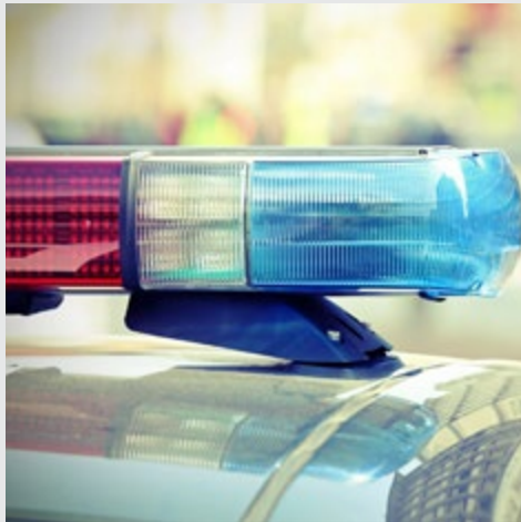
Emergency Lighs can be added to any van