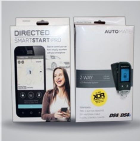
GPS Tracking your van to fit YOUR needs!