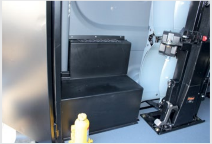
Covers for Rear A/C