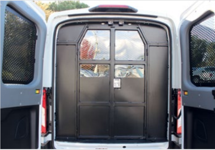
Nor Cal Vans design of Rear Door with window

We will customize your van to fit YOUR needs!