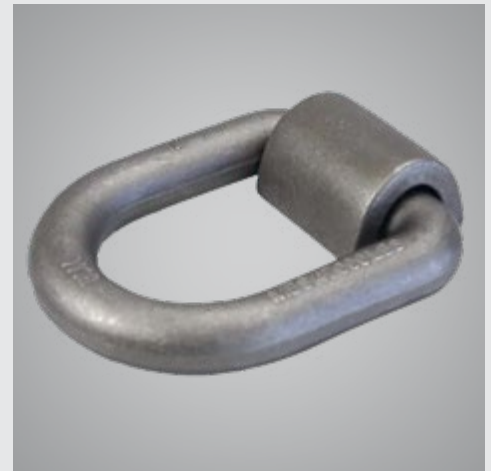
Shackle Ring can be added to floor

Nor Cal Vans has certified emergency vehicle technicians on staff allowing us to install electronics and other items on law enforcement vehicles. And our Ford QVM certifications allows us to upfit vans without voiding factory warranties!