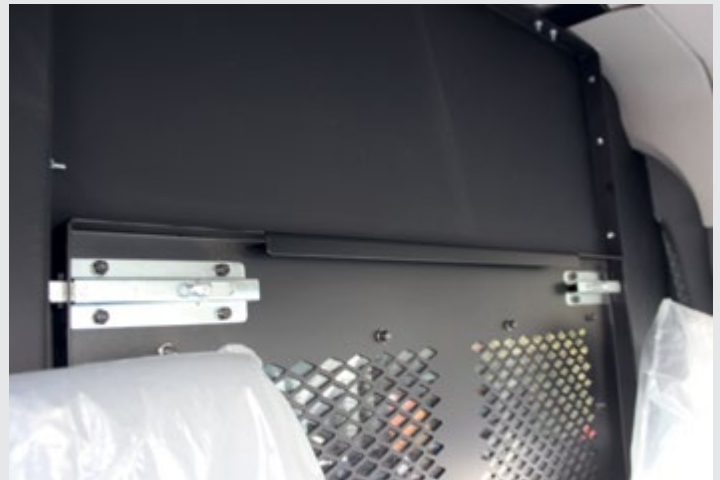
Partition made of durable steel separating driver and prisoners.