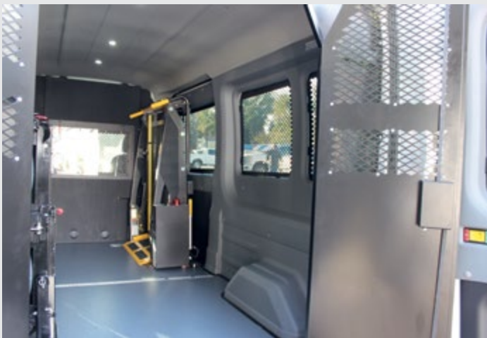
Wheelchair Lifts can be added to any van